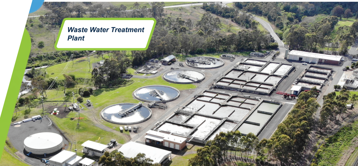
Waste Water Treatment Plant