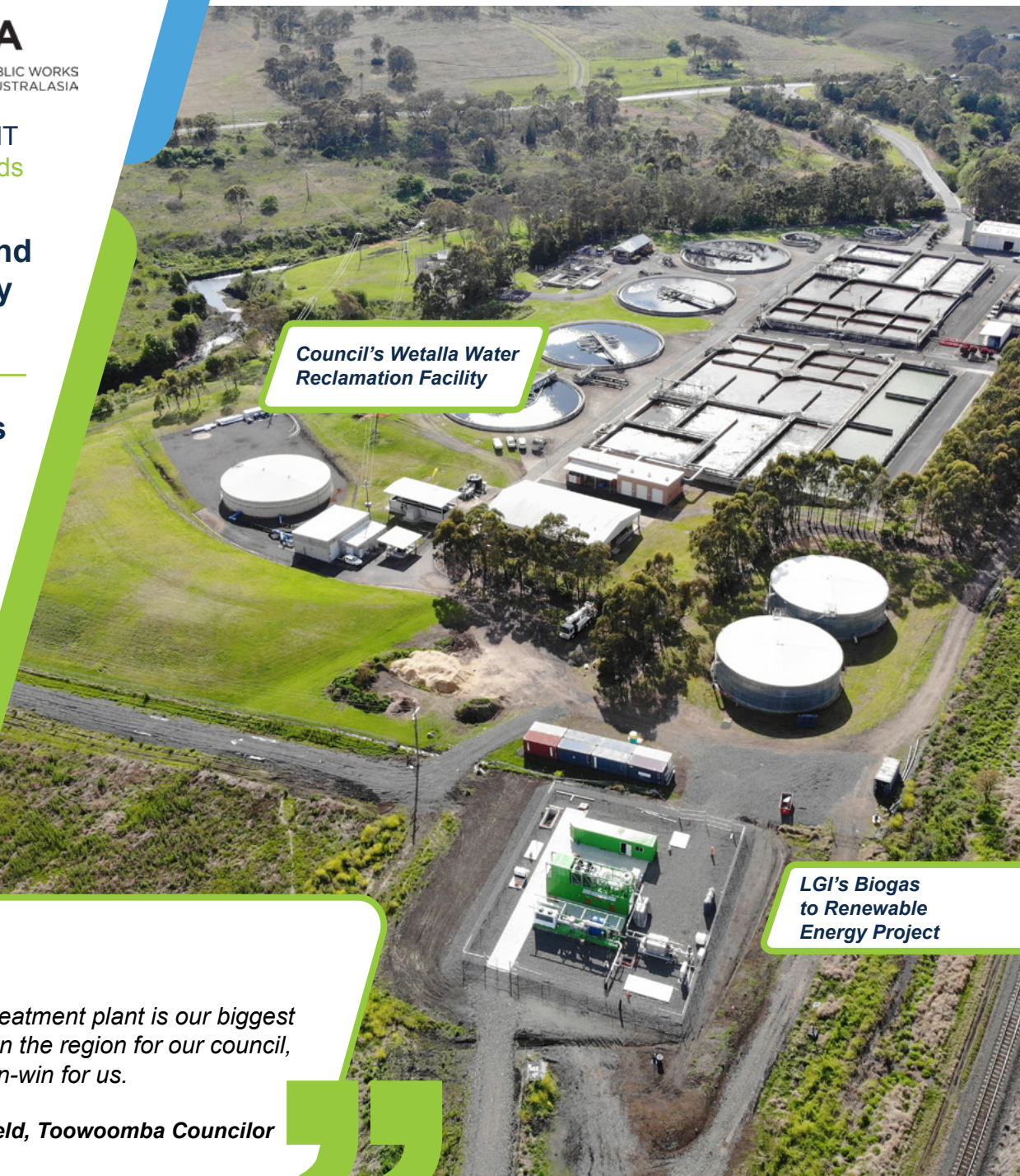
Council's Wetalla Water Reclamation Facility