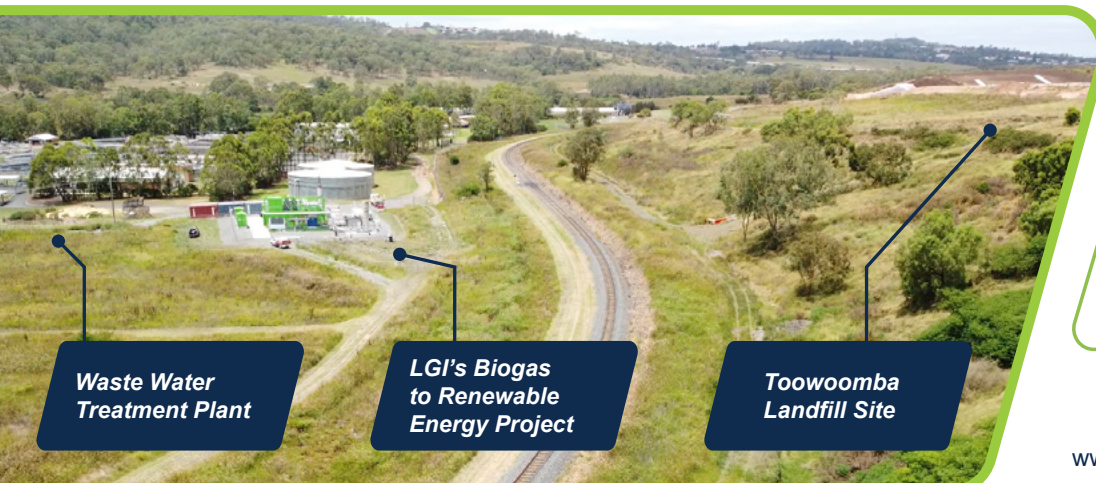
Waste Water Treatment Plant

Effective extraction and flaring of biogas from landfills can abate carbon and also turn some landfills into clean energy generators - fighting climate change right where it begins.